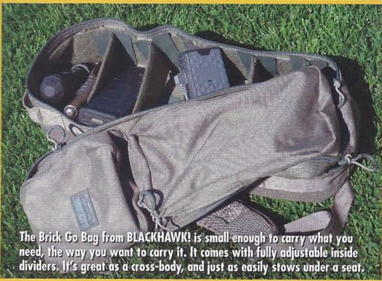
The Brick Go Bag from BLACKHAWK! is small enough to carry what you need, the way you want to carry it. It comes with fully adjustable inside dividers. It's great as a cross-body, and just as easily stows under a seat.

enough room for your credentials, tablet and anything else a gal might need to carry. With individual pockets, you don't have to worry about getting "stuff" in your triggerguard or flashing the checker at the grocery store.