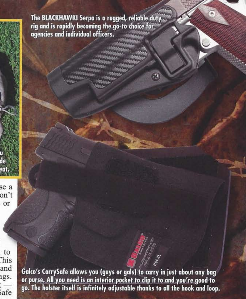
Galco's CarrySafe allows you (guys or gals) to carry in just about any bag or purse. All you need is an interior pocket to clip it to and you're good to go. The holster itself is infinitely adjustable thanks to all the hook and loop.

The BLACKHAWK! Serpa is a rugged, reliable duty rig and is rapidly becoming the go-to choice for agencies and individual officers.